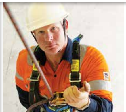
HEALTH & SAFETY