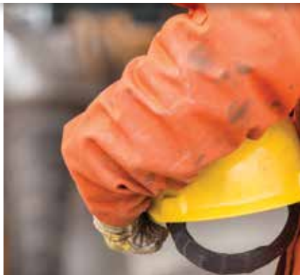
DUTY OF CARE