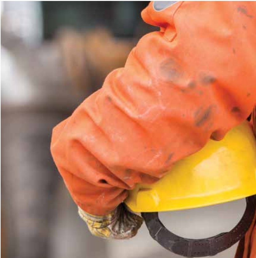
DUTY OF CARE