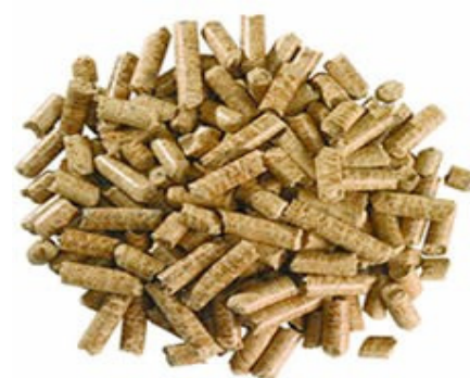
Biomass Feedstock Sample